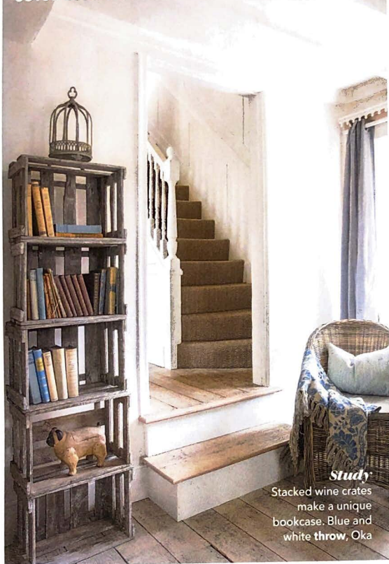
Study Stacked wine crates make a unique bookcase. Blue and white throw, Oka