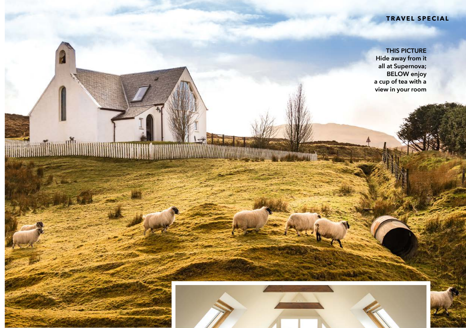
THIS PICTURE Hide away from it all at Supernova; BELOW enjoy a cup of tea with a view in your room

A little way out of town at the famed racing estate, the boutique Goodwood Hotel offers stylish accommodation in a bucolic setting. Try dinner in Farmer, Butcher, Chef, the hotel's bistro-style dining room.