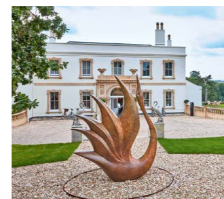
THIS PICTURE The glorious British countryside; BELOW spend the night at Lymestone Manor