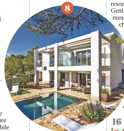
7Pines Kempinski in Ibiza

An evening watching your little ones' show in the children's theatre, a few games with grandad on the pétanque court, lilo racing in the pool and big family meals cooked by the in-house chefs will be on the agenda at Le Grand Banc. This place is more village than a villa, sleeping 24 in its stone buildings around their own little paved street. Spend days out exploring dramatic ▶