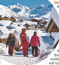
La Rosière in France

Fulufjellet National Park — brown bears, wolves, lynx and wolverines — but the polar bears are far away to the north in Svalbard. Elk and golden eagles might put in an appearance too, during easy walks of about six hours a day led by the expert guide Diane, who chats about folklore and wildlife as you go. Accommodation is in a large tepee. Details Six nights' full board from £720 per adult, from £400 per under-18, including transfers (responsibletavel.com). Fly to Oslo