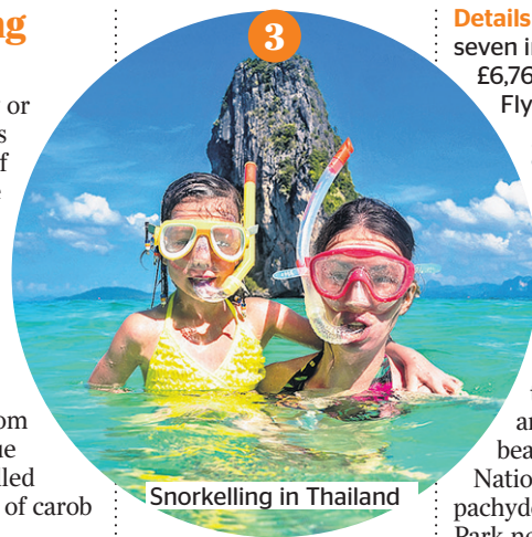
Snorkelling in Thailand

Watching a private puppet show or learning to make marzipan fruits in your villa's garden are some of the delightful activities available at the Thinking Traveller's new properties in the east of Sicily next year. The company can organise private chefs for family meals or to host cookery lessons, and arrange boat charters to explore hidden spots along the coast. The four-bedroom villa I Lentischi, near the baroque city of Noto, has a 14m pool, walled courtyard and a tranquil garden of carob and olive trees.