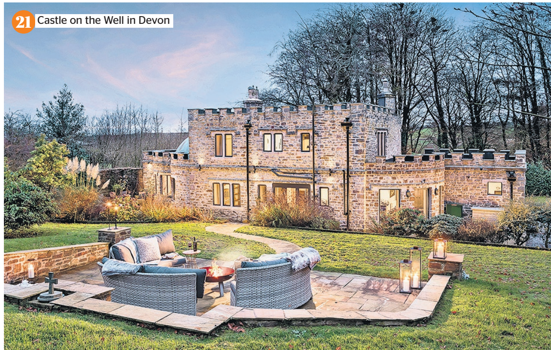
21 Castle on the Well in Devon

Will 2021 be the year to try skiing in Scotland? Booking a package makes it less daunting; on this trip you'll stay in a hotel in the eastern Highlands and a second in the western, so you get easy access to the region's five main resorts.