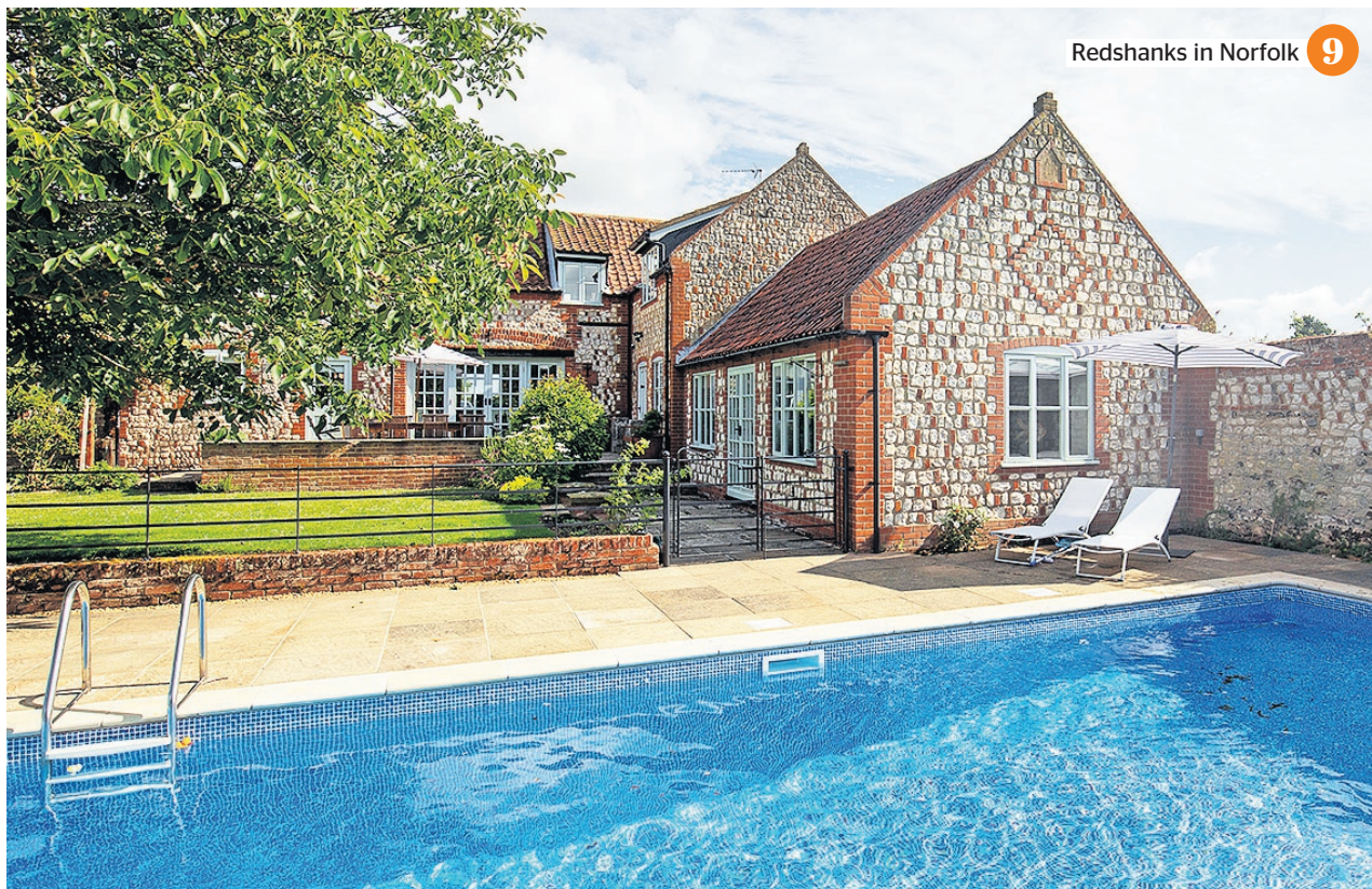
Redshanks in Norfolk 9

light, but the honeyed beams, open fireplace and warm red furnishings keep it characterful. Outside, you can relax in the hammock alongside the heated pool, while the grounds beyond come with a vineyard, lake and zip wire. If that's not enough to get you going, grab your bike or put on hiking boots and explore the trails that carve up Hampshire's wild forests and heaths, spotting wild ponies as you go.