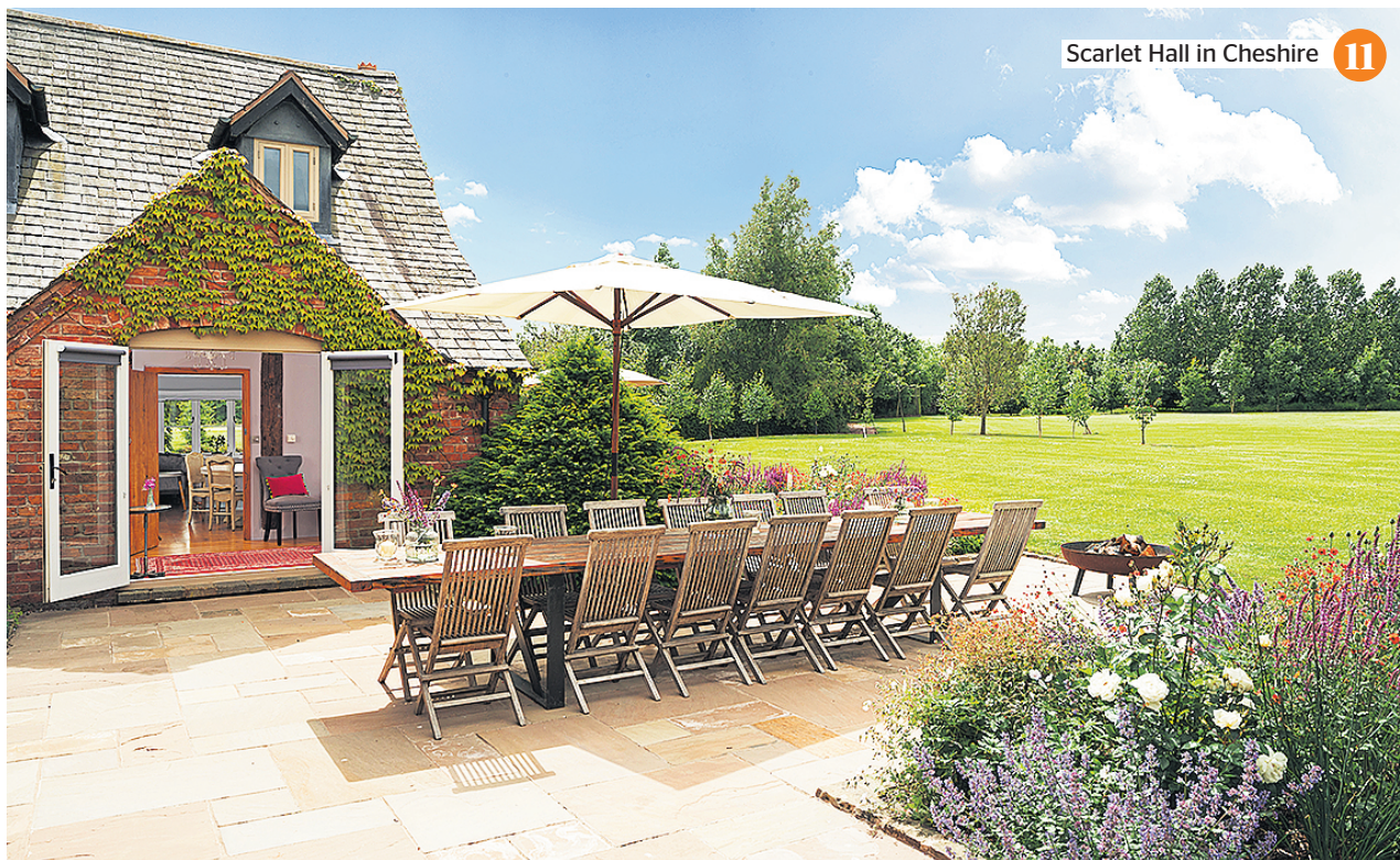
Scarlet Hall in Cheshire 11