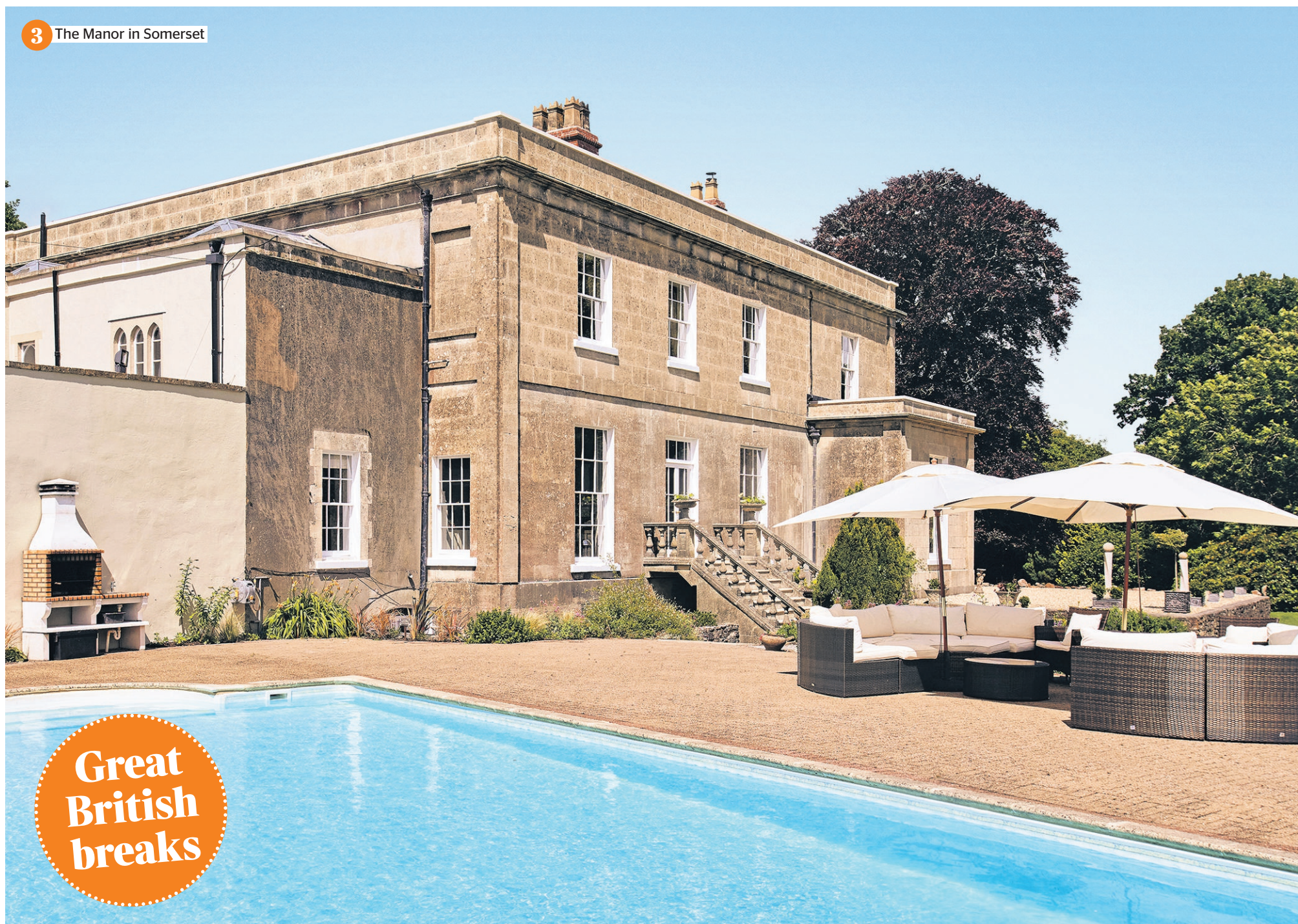
3 The Manor in Somerset

‘The grapes seem happy here — the extreme heat and cold results in pure, intense wines’ British Columbia’s Okanagan Valley is Canada’s Napa