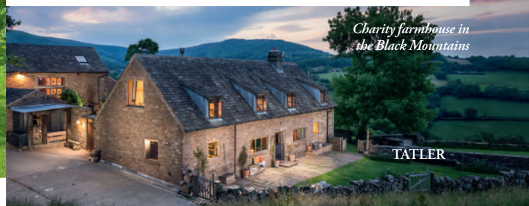
Charity farmhouse in the Black Mountains

Imagine a remote mountain hideaway with staggering views and miles of first-class walking. Then add all the creature comforts you'd want after an all-day hike, and Charity is the result. A wild beauty at the end of a four-mile track in the Olchan Valley, this romantic farmhouse looks out towards the Brecon Beacons and Black Mountains. A series of interconnected converted buildings wrap around a central courtyard, where guests can enjoy a fire pit, barbecue and wood-fired hot tub. There are six bedrooms, and cosy dining and sitting areas. A barn has been converted into a cinema-cum-billiard room, perfect for when the rain descends. uniquehomestays.com