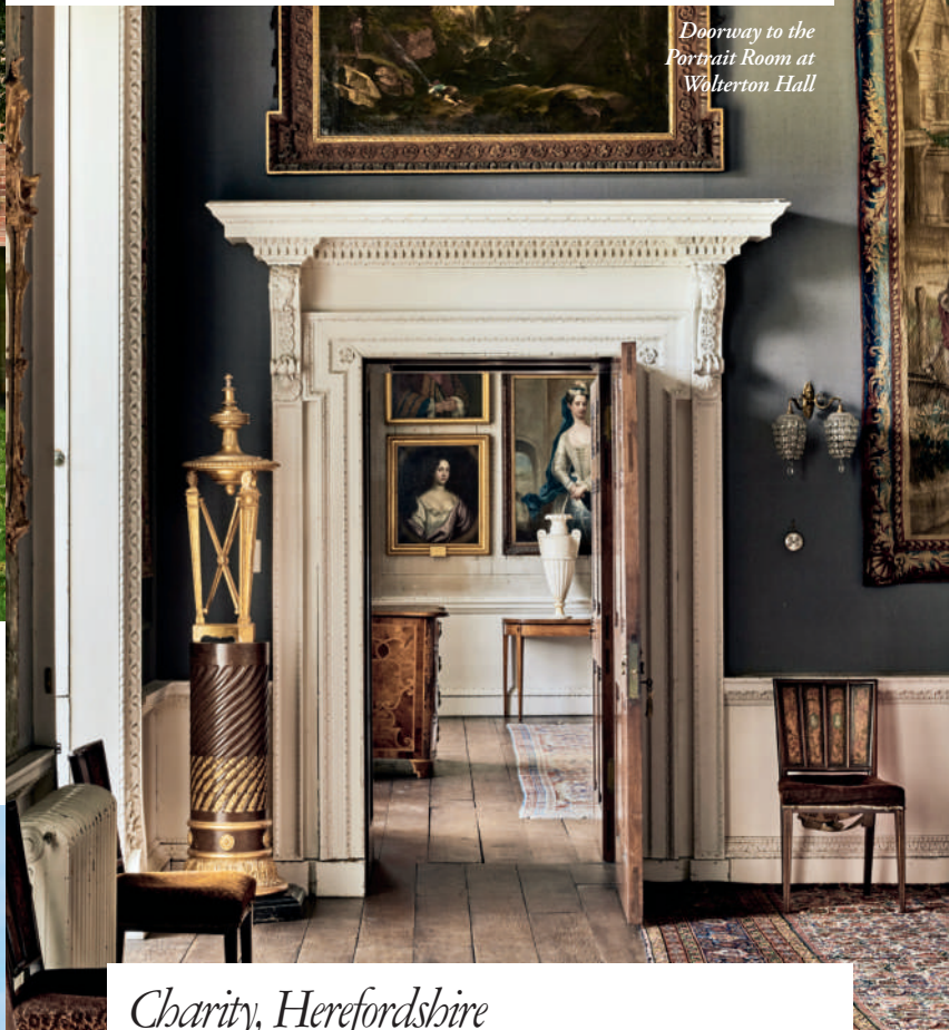
Doorway to the Portrait Room at Wolterton Hall