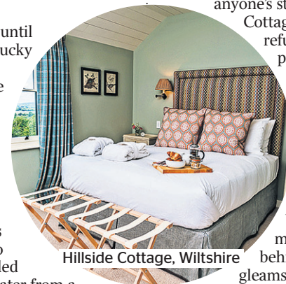
Hillside Cottage, Wiltshire