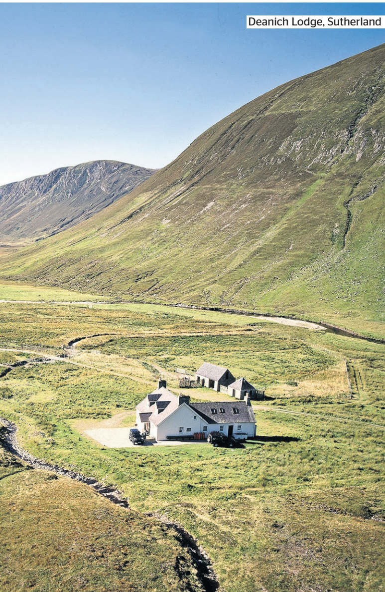
Deanich Lodge, Sutherland