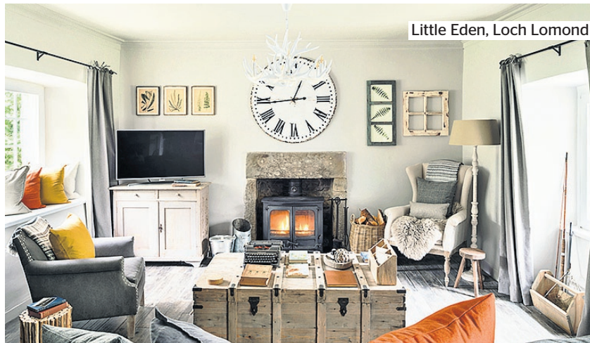
Little Eden, Loch Lomond

stellar kayaking from a private beach. Details Seven nights' self-catering for four from £2,295 (uniquehomestays.com)