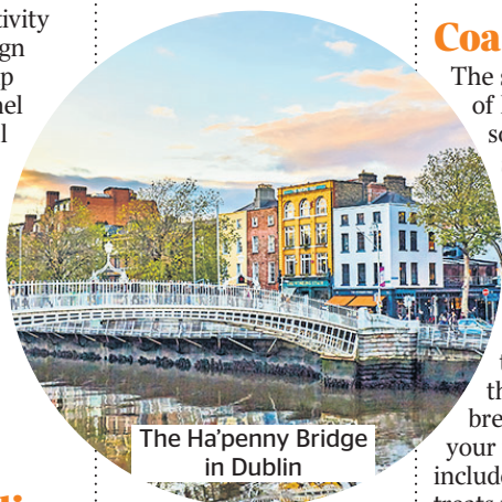
The Ha'penny Bridge in Dublin