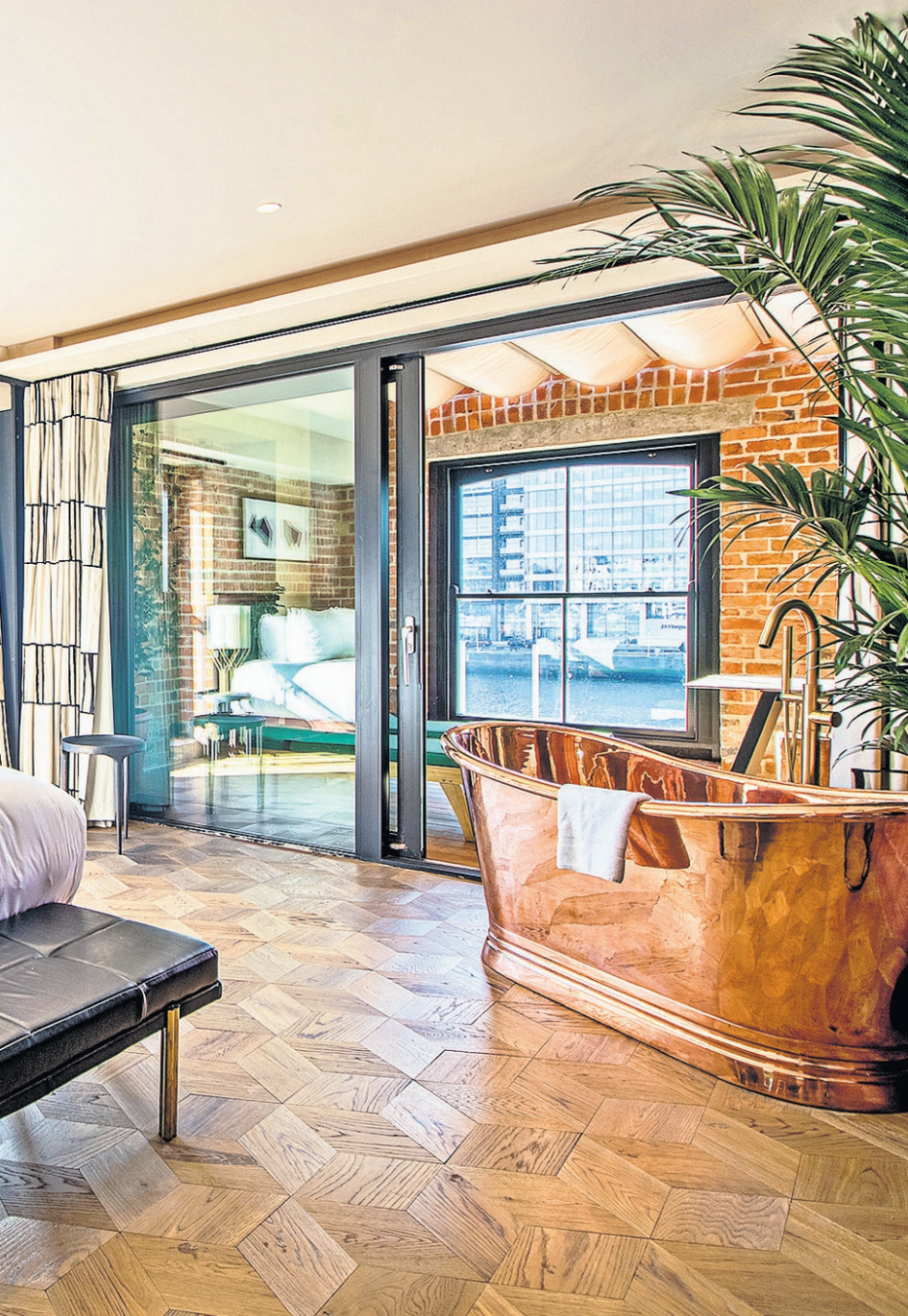
The Mayson, on the banks of the Liffey in Dublin

And rightfully so — soon after it scooped a second Michelin star. A meal here will stick in your mind for months: each dish arrives like a delicate piece of art, finished tableside with a theatrical flourish. The £54 lunch menu is one of the best deals in town (chapteronerestaurant.com). Stay in the sleek apartments in Zanzibar Locke, a 15-minute stroll away on the River Liffey.