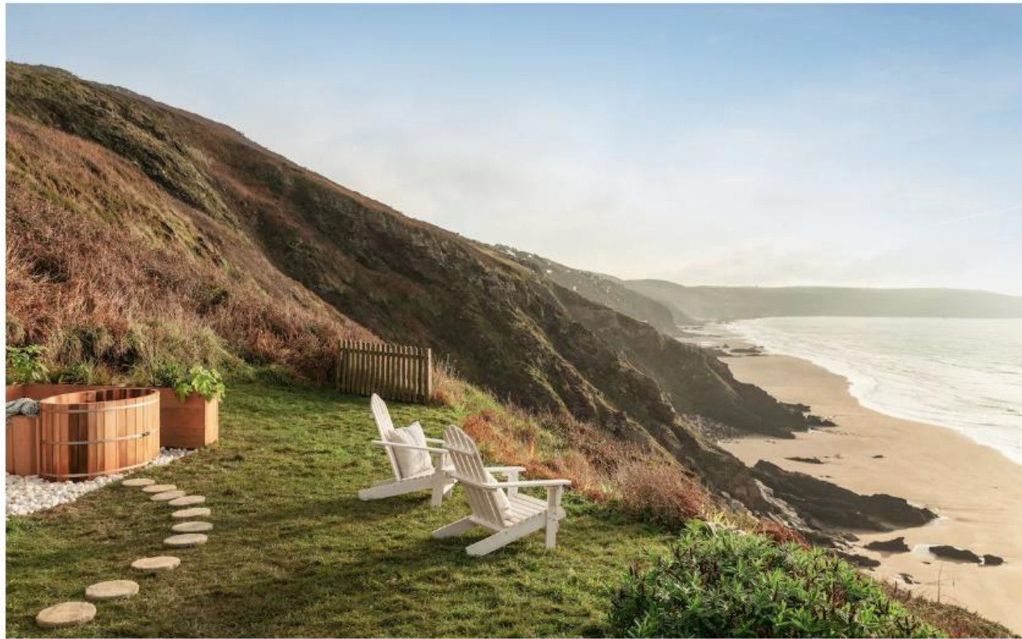
The romantic Aurora looks out over one of Cornwall's lesser-visited beaches

From off-the-grid houses to cottages in hidden coves, there's nothing like finding your own stretch of sand, says our writer