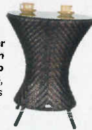
Alexander Rose Ocean Wave bistro table , £249, Heal's

DINING ROOM The pine table can seat 14, and has been teamed with wicker chairs. Find a similar table at Country Interiors. Harola chairs, £45 each, Ikea, are comparable. Blinds made in Blazer Stripe , £27.50 per metre, lap Mankin