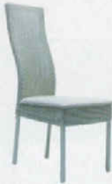
Wave dining chair , from £331, Lloyd Loom of Spalding