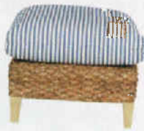
Elmwood stool in Kingsland Stripe, £349, Marks & Spencer