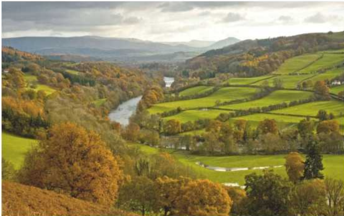
The beautiful, meandering River Wye forms the England/Wales border for part of its course

Here the road narrows again, twisting down to the tourist honey pot of Hay-on-Wye. These days there are as many delis and cafes as book shops in the festival town. Between the sustainable fairtrade store and a gallery "geospace" dedicated to love and light, Hay is an emporium of the eclectic.