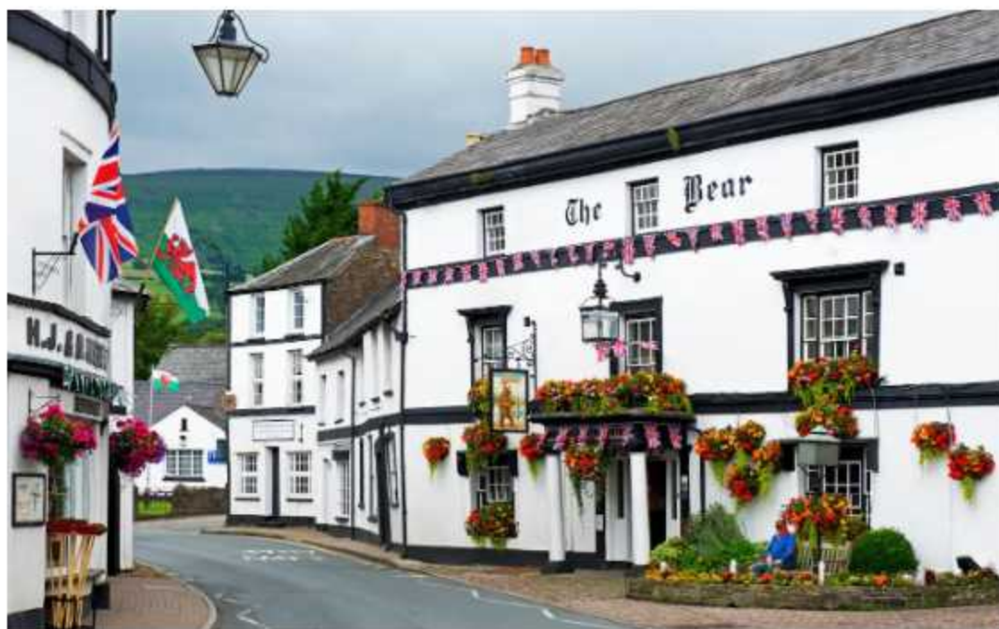
Perfectly preserved Crickhowell is home to the best high street in the UK

There's no chance of 50mph here in the winding valleys of the Black Mountains. We've traversed south from Crickhowell along the A40 to Abergavenny – today gridlocked with a food festival celebrating local produce – and north via Pandy onto the single-track road past Llanthony Abbey.