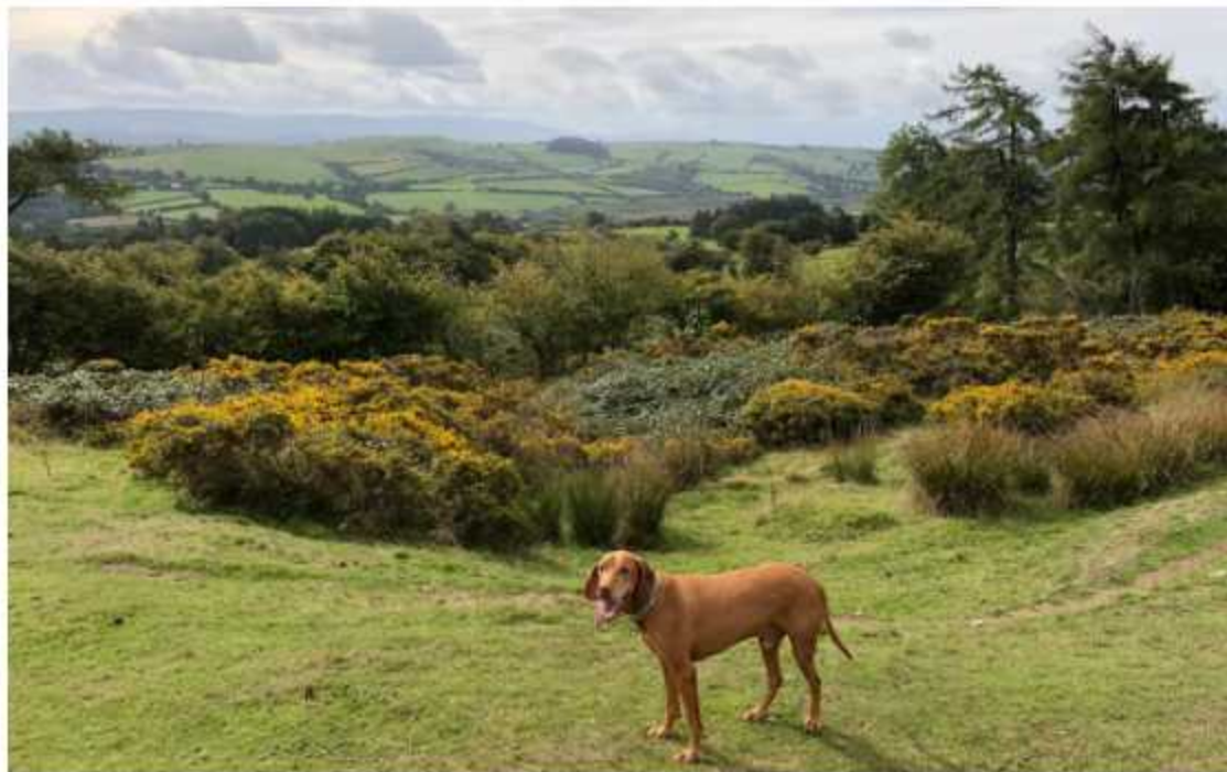
Offa's Dyke path lies at the rear of the luxury cottage at Alchemy Hill

Long before American cowboys moved their cattle over the prairies, medieval drovers passed by this remote spot. They moved sheep and other animals from the upland grazing of Wales to the fattening pastures and markets of the Midlands.