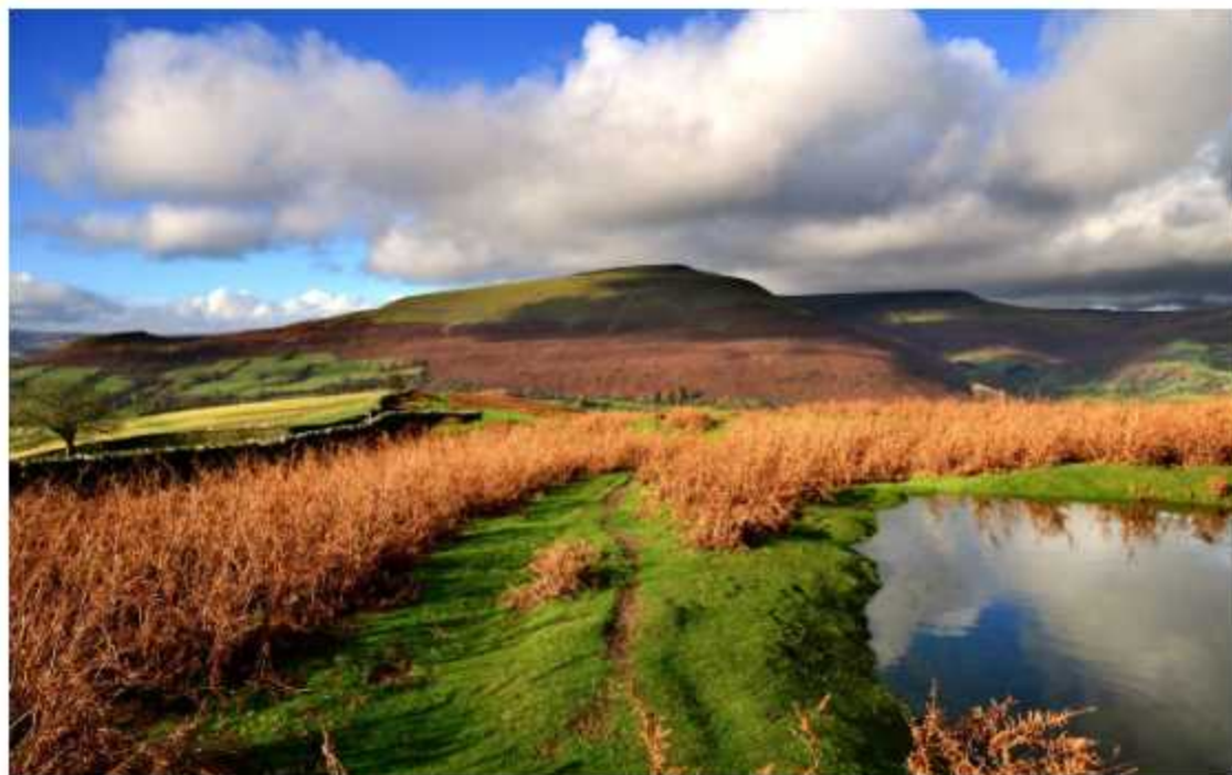
The Black Mountains are chock full of scenic vistas – and narrow roads