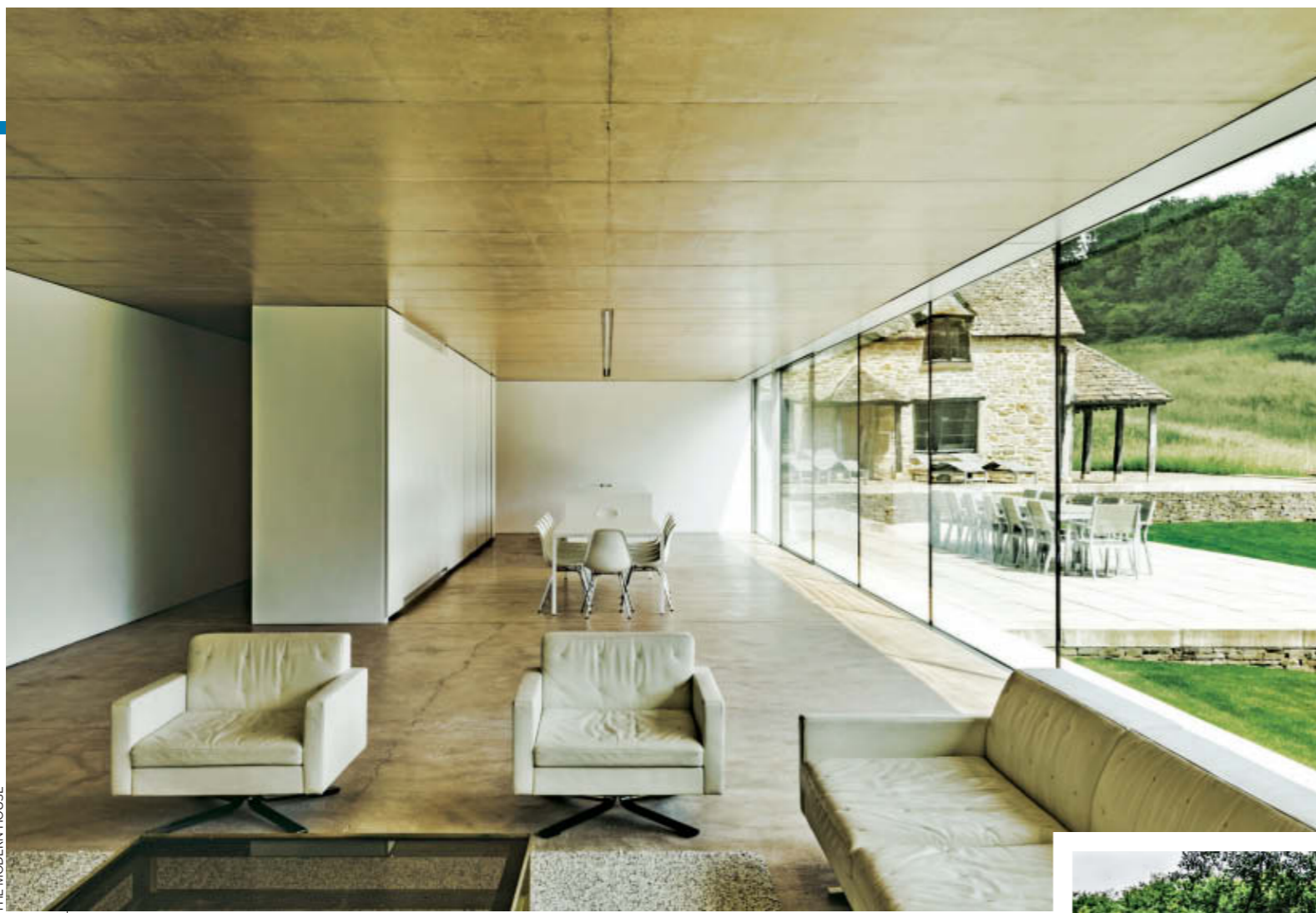
THE MODERN HOUSE