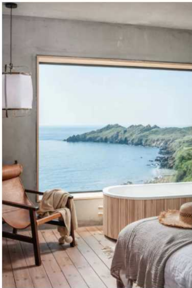
1. UKIYO, COVERACK, CORNWALL