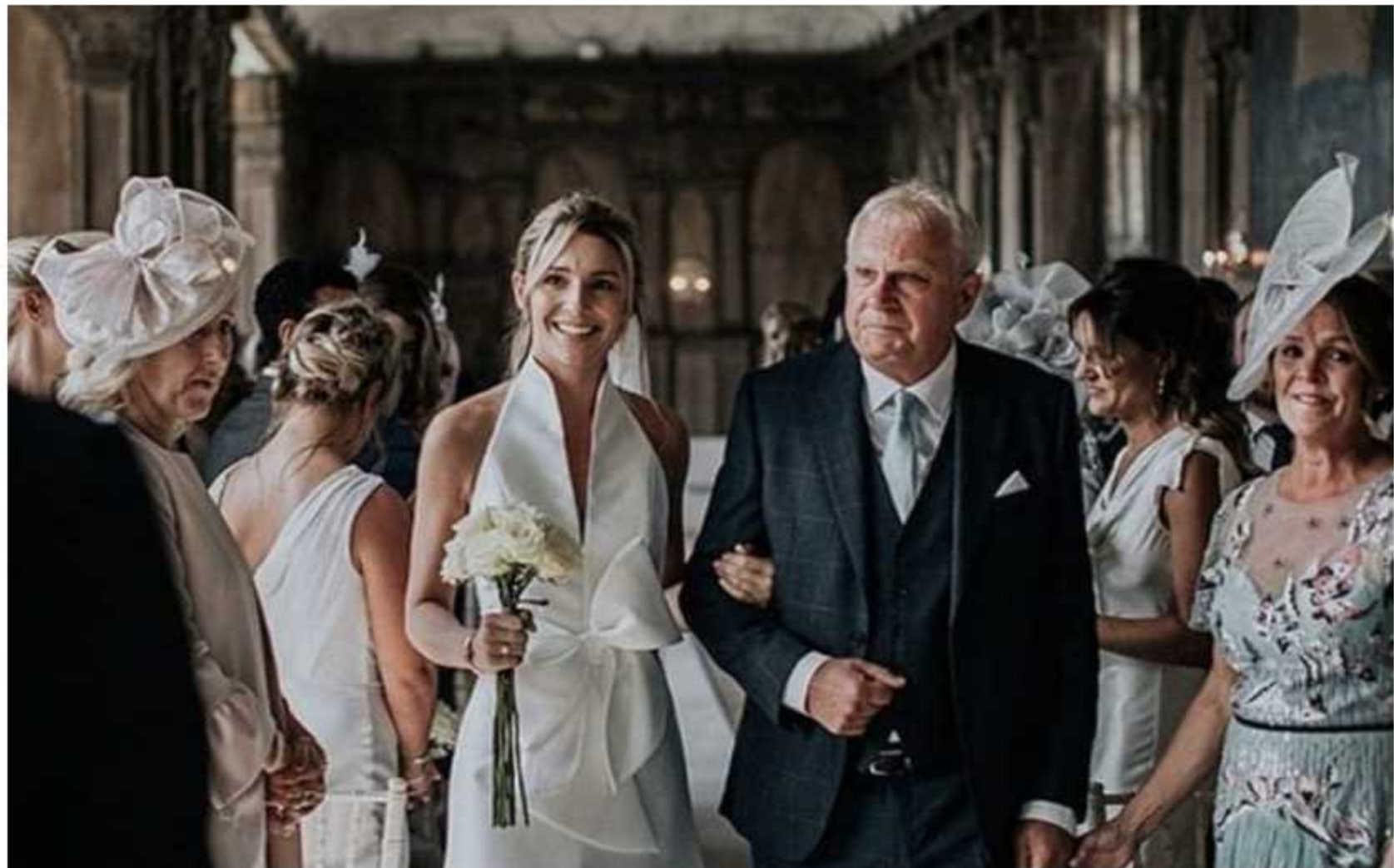
Haddon Hall, Derbyshire