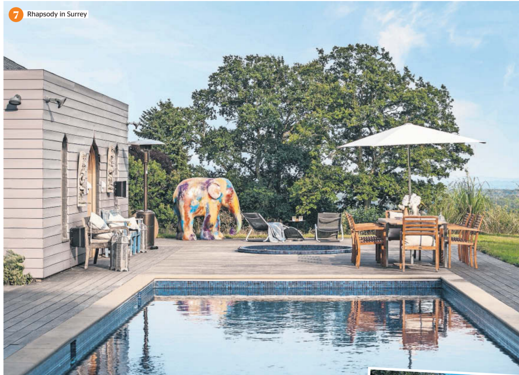
7 Rhapsody in Surrey

Just when you thought there wasn't a bed left anywhere in Cornwall this