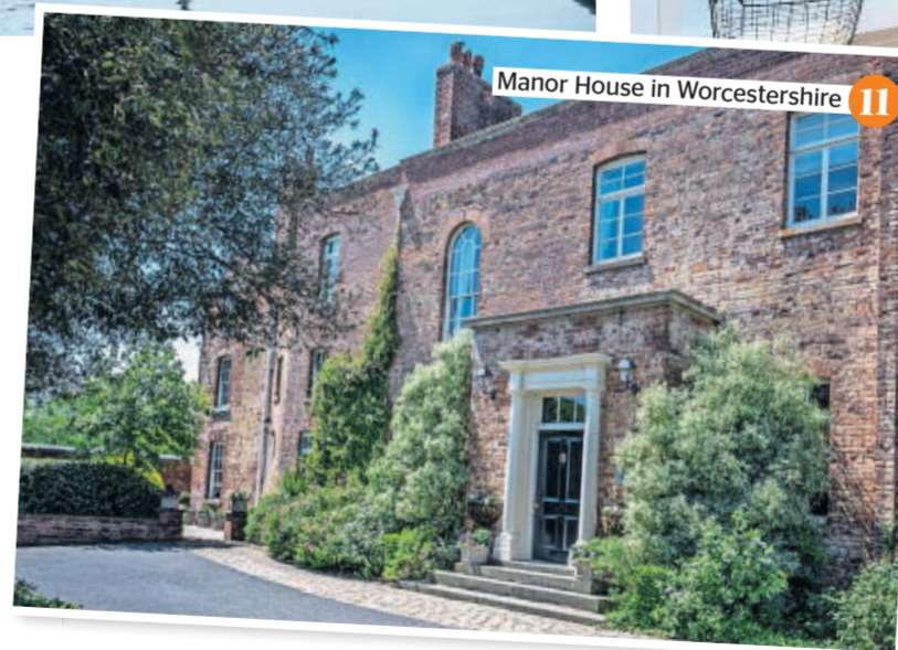
11 Manor House in Worcestershire

Sheepscombe House, a honey-hued Georgian manor house, lies just south of