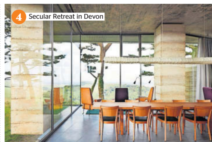
4 Secular Retreat in Devon

Personal privacy with hotel perks — including a full English each morning — are what you get at the Manor House in the grounds of Stanbrook Abbey, a grade