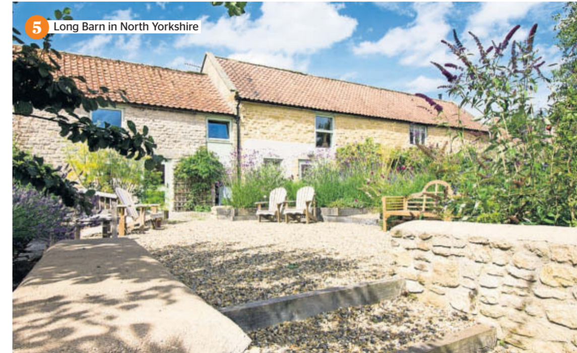
5 Long Barn in North Yorkshire

Gloucester, 1 hr 45 min by train from London Paddington. The traditional interiors — there's a Shaker kitchen and sweeping staircase — have been given a bright lick of paint for summer. Other indoor novelties include a drawing room, cinema room and music room. Outside a heated outdoor pool and wood-fired pizza oven add to the fun. Stage your own mini Wimbledon on the private grass tennis court. Details Seven nights' self-catering for ten from £17,500 (luxurycotswoldrentals.co.uk)