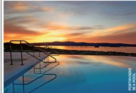
PORTAVADIE SEA POOL

If one pool isn't enough, the Ned has two — the slick rooftop pool reminiscent of a New York terrace, and the spa's pool in the basement (chicer than it sounds). The latter oasis is the fashion editor's choice for a swim pre or post-treatments. thened.com