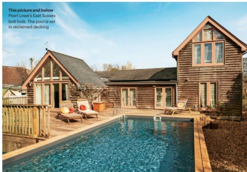
This picture and below Pearl Lowe's East Sussex bolt hole. The pool is set in reclaimed decking

Once considered the height of naff, the swimming pool is now the ultimate outdoor status symbol, says Samuel Fishwick . The only problem? The great British weather, of course