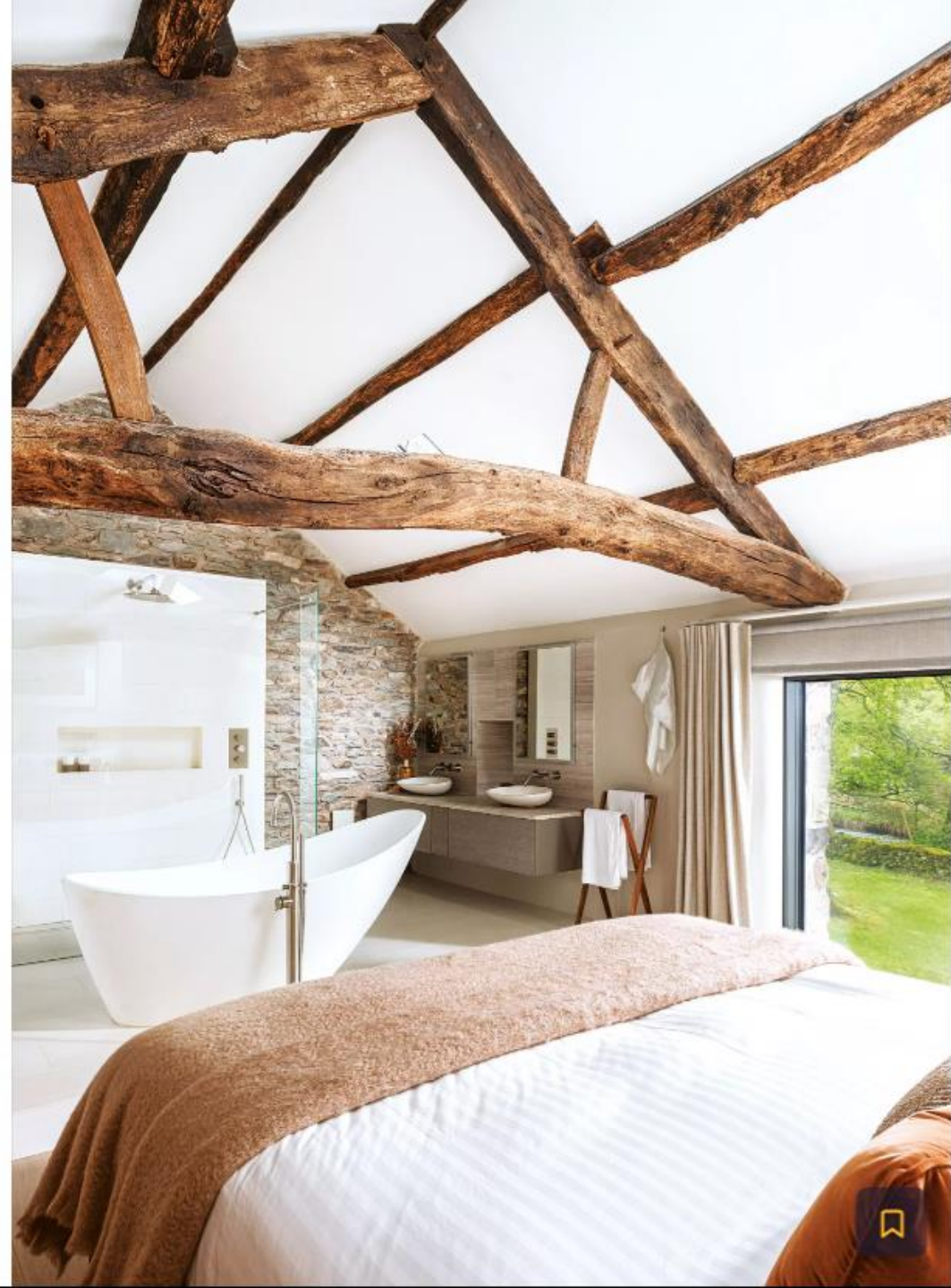
MAIN BEDROOM The stone wall of the former barn creates a natural, tactile backdrop to the open-plan bathroom area, with original beams spanning the space. Bathroom fittings , CP Hart. Tiles , Salvatori